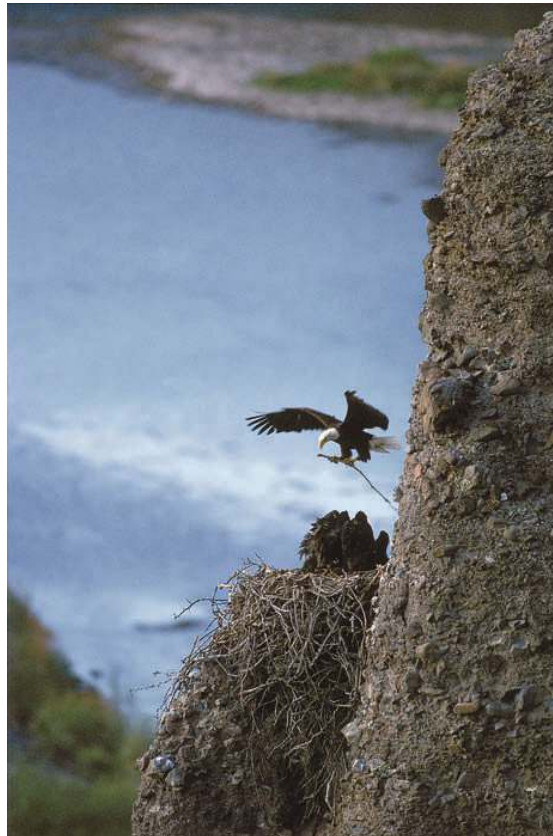
Desert Nesting Bald Eagle