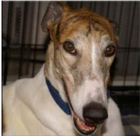
"Jett"